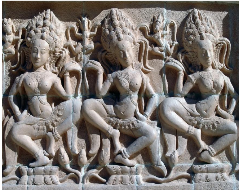
"Indian Stone Carving"